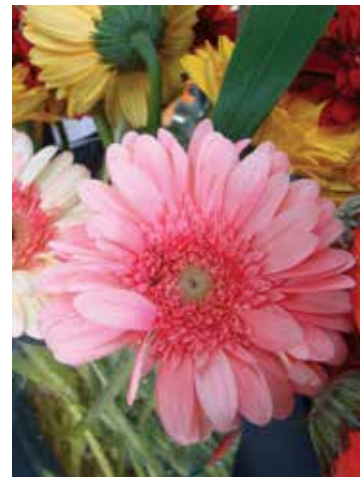
Explore the inner beauty of flowers at Bauer Park.

Learn about upcoming events at Bauer Park at: www.facebook.com/bauerparkmadisonct Educational programs can be arranged for school, scout and community groups at Bauer Park, Rockland Preserve and the town beaches. Contact the Beach & Recreation Office at 203-245-5623 for more information.